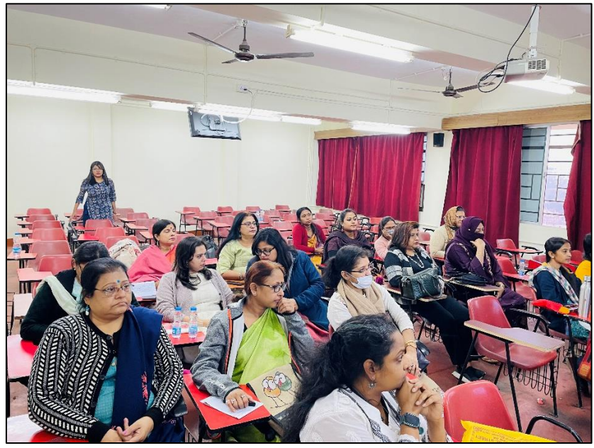
Workshop on "Inexpensive Traditional Marketing for Micro Entrepreneurs" at the University of Calcutta on 19<sup>th</sup> January, 2023