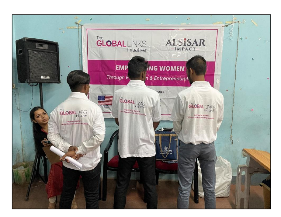
Students wearing TGLI logo embedded T-Shirt