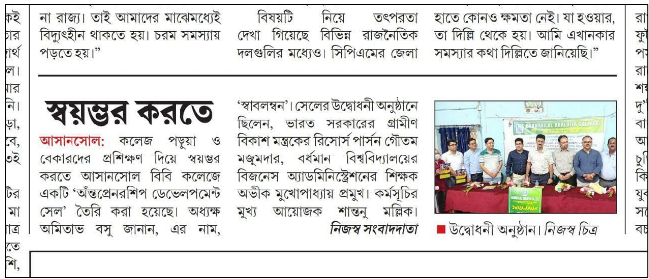
Report published in Anandabazar Patrika on 18/07/2023