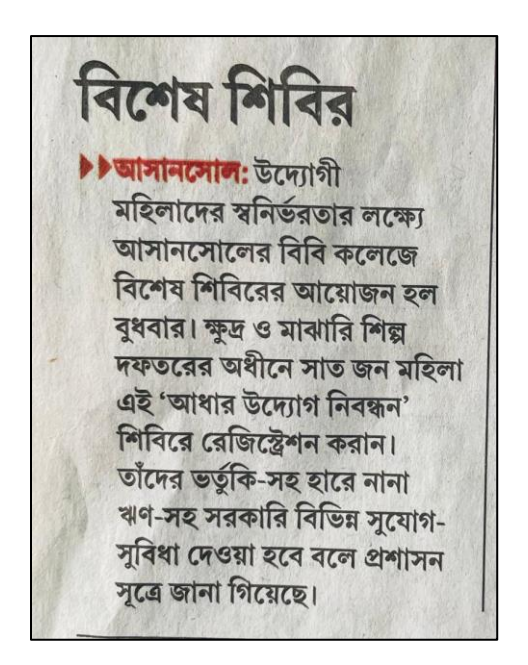
Anandabazar Patrika dated 08/06/2023

Name of the event: Workshop on Importance of Branding on 07/06/2023 in Banwarilal Bhalotia College, Asansol in collaboration The Global Links Initiative