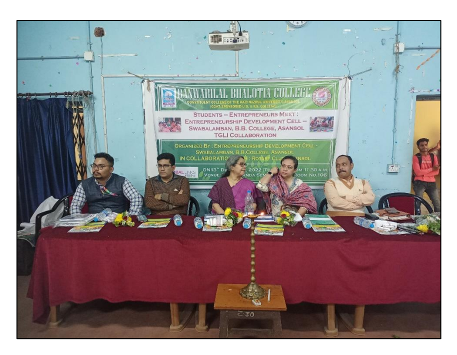
The Global Links Initiative (TGLI) team visited college